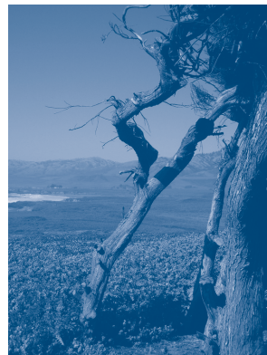
A typical picturesque view from the northern coast of San Luis Obispo county