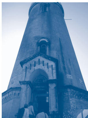
The entrance to Piedras Blancas Light Station and its wonderful interior circular staircase